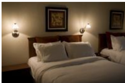
Guest Room (Double)