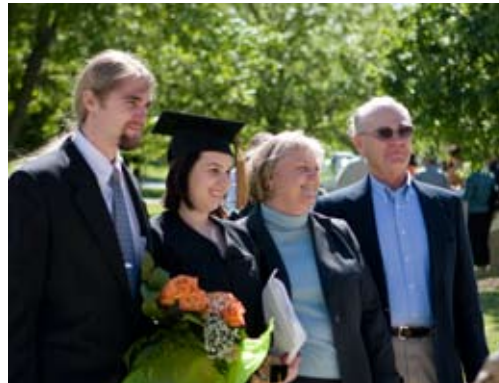
Families celebrate after commencement ceremonies.